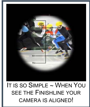
IT IS SO SIMPLE ~ WHEN YOU SEE THE FINISHLINE YOUR CAMERA IS ALIGNED!

When you choose a Lynx packaged solution, you can be safe in the knowledge that you have made an intelligent investment. You will have everything you need to produce and distribute accurate results. What is more, you will have the ability to distribute those results to a huge range of scoreboards from many manufacturers, so many customers are able to integrate their existing